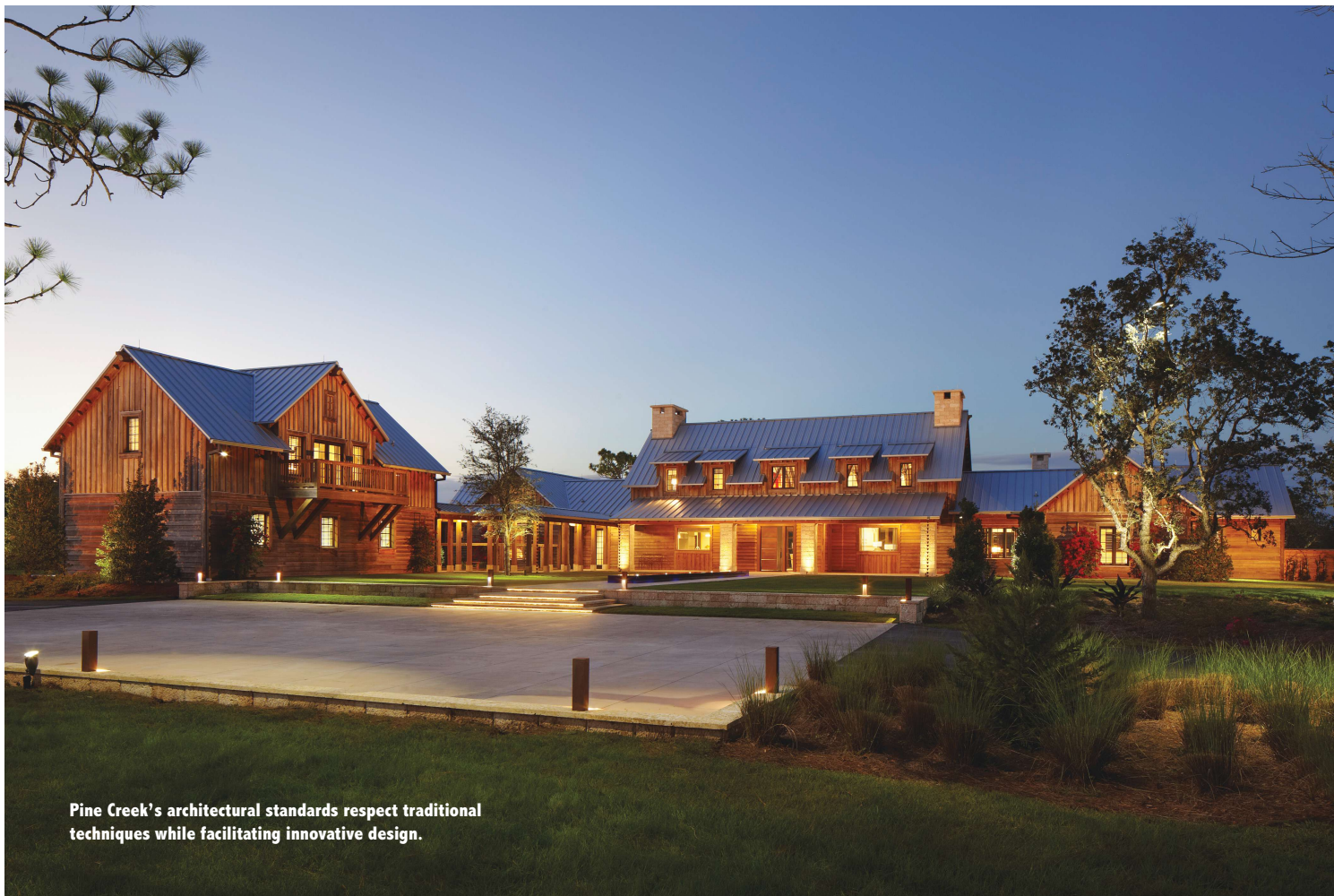
Pine Creek's architectural standards respect traditional techniques while facilitating innovative design.